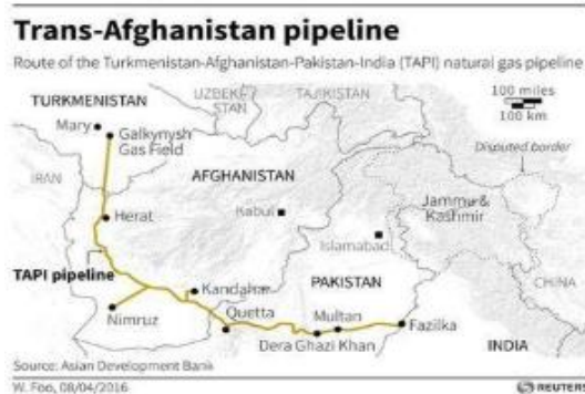
Figure 2: The Turkmenistan- Afghanistan-Pakistan India Gas Pipeline

Another connectivity framework component is connecting energy-rich regions to energy-sparse areas. In this regard, The Turkmenistan-Afghanistan-Pakistan-India (TAPI) Pipeline, a 1,814-