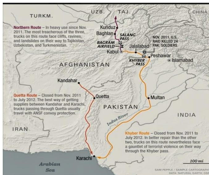
Figure 3: Khyber Pass Economic Corridor

An important exception in the evolving regional geopolitics has been the continuation of the Sino-